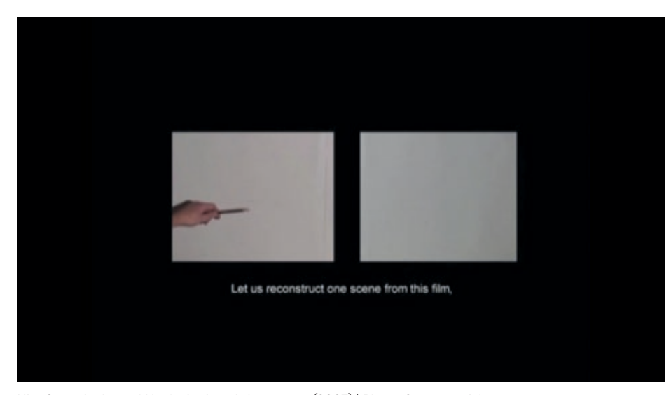
Hito Steyerl - Journal No. 1 - An Artist's Impression (2007)

<sup>[1]</sup> https://lightcone.org/en/film-6256-journal-no1