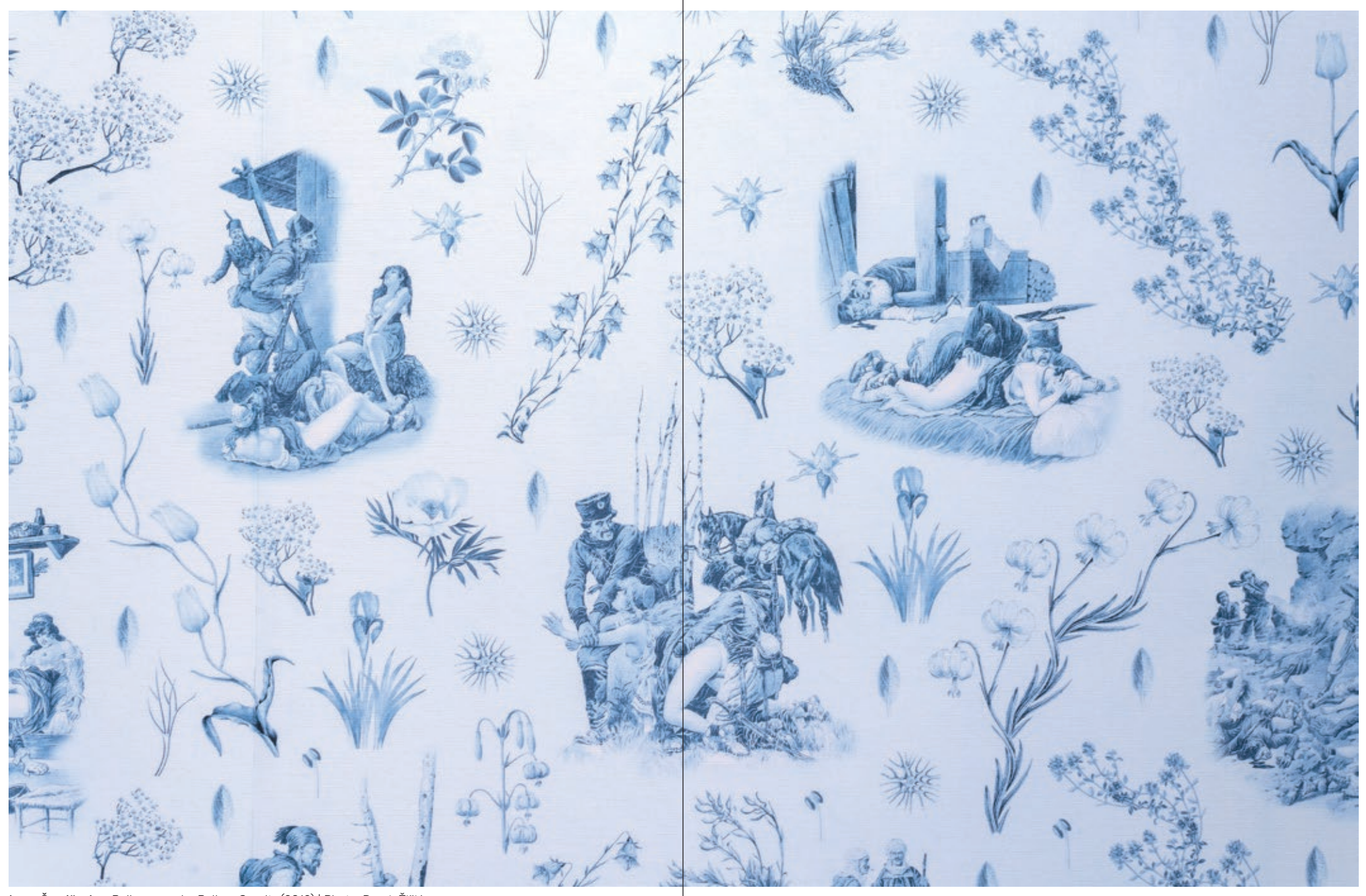
Lana Čmajčanin - Balkangreuel - Balkan Cruelty (2019)