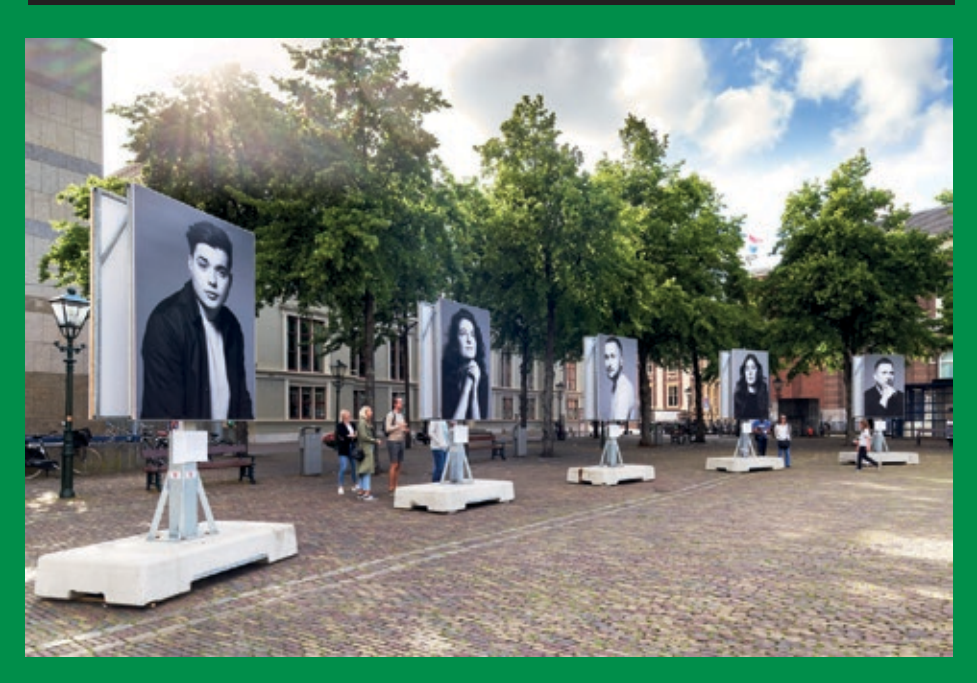
Bosnian Girl - Temporary Monument - Srebrenica is Dutch history (2020)